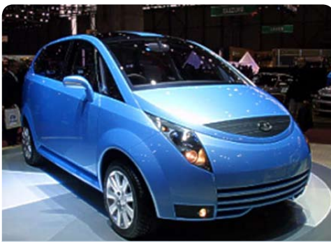
Tata 'Nano' export model

Dubbed the 'People's Car', the 'Nano' first appeared at this year's New Delhi Motor Show. Both the basic model (pictured at right) and the 'up-market' model (see below) have CVT variable transmission.